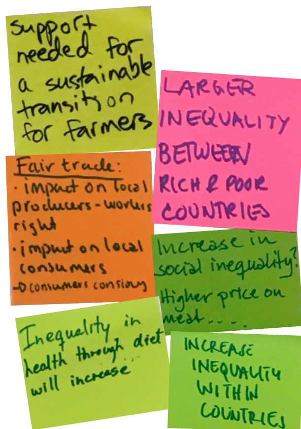
Insights from the stakeholder dialogues regarding an equitable and just food transformation.