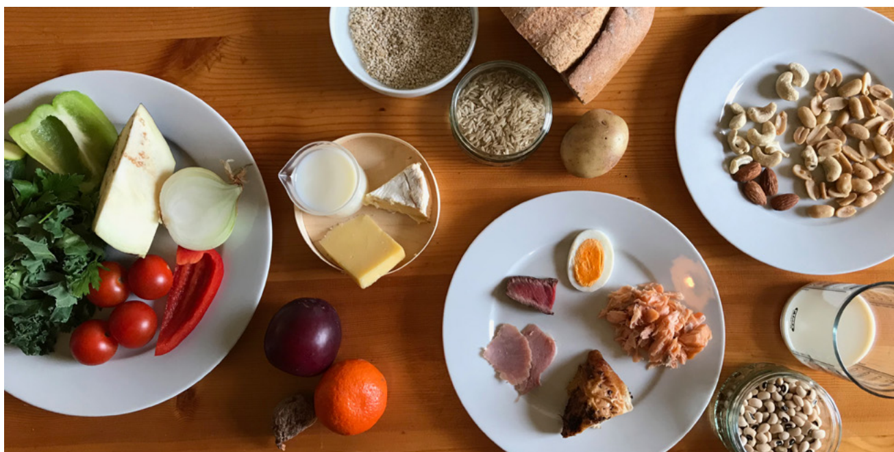
How would a sustainable diet look in the Nordic context?