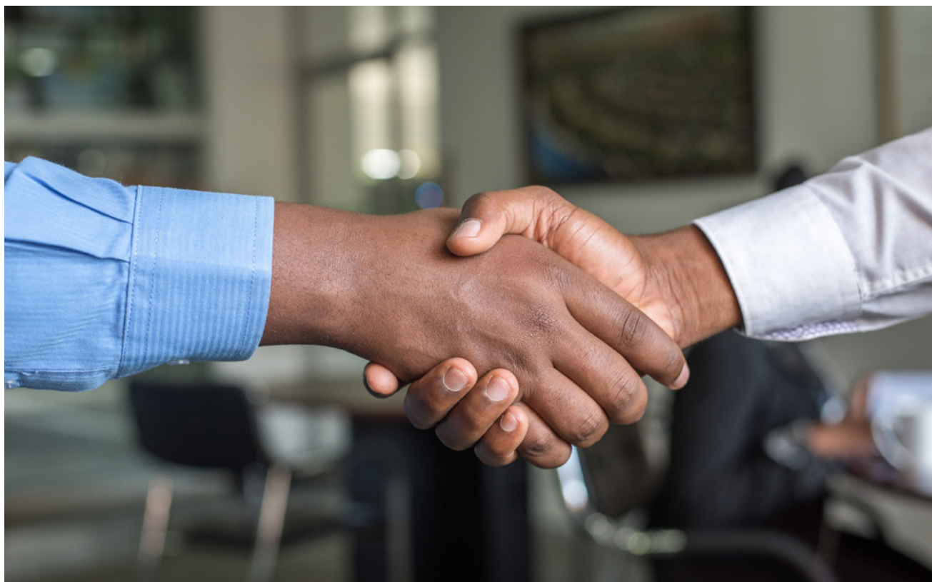
Dialogue participants identified many export opportunities that could result from shifts to sustainable food systems.