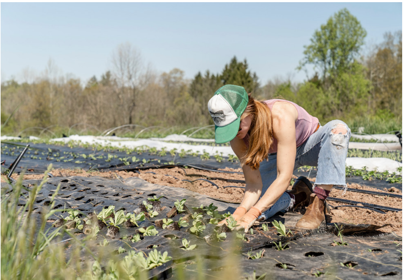
Food producers are the stewards of our land and seas.