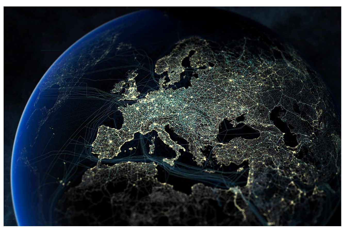
Planet earth; A beautiful complex place. Image: Wikimedia Commons

RESILIENCE OFFERS A WAY to embrace these challenges because it is well suited to working in the complex problems space. Resilience insights suggest that in order to navigate the complexity of the world, development interventions must take into account that: