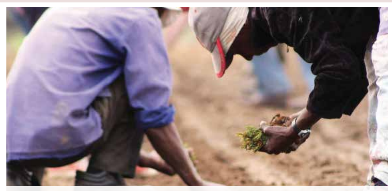
Farmers in the biodiverse Baviaanskloof region of South Africa have transitioned from goat farming, which resulted in vegetation overuse and soil erosion, to more sustainable agricultural practices, thereby becoming landscape stewards and enabling the restoration of degraded hillslopes.

erosion). In the privately owned western part of the Baviaanskloof, more than 9,000 hectares of land is considered degraded. An NGO in the region is working with the government and local farmers to enable transformations to more sustainable farming practices. These farmers have become landscape stewards, overcoming initial conflicts between farming and soil conservation and participating in a large-scale land rehabilitation program.